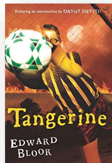
7 th grade Tangerine , by Edward Bloor