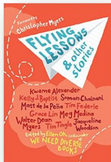
6 th grade Flying Lessons & other Stories